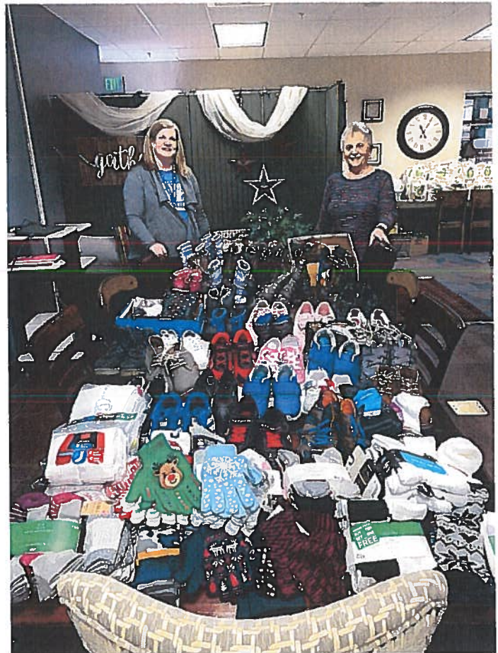
Shoes, boots, gloves and socks gathered at the Ladies' Brunch to be given to Whitney Elementary School.

Our vision: Turning faith, hope and love into action on behalf of women, children and youth around the world.